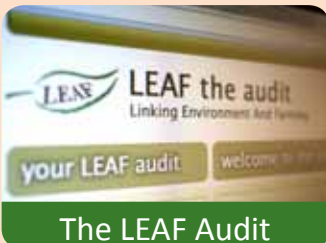
The LEAF Audit

Only available to LEAF members and included in your membership fee, the LEAF Audit provides a comprehensive health check of the farm and gives benchmarks and action plans to focus the business for the year ahead. Saving you time and money.